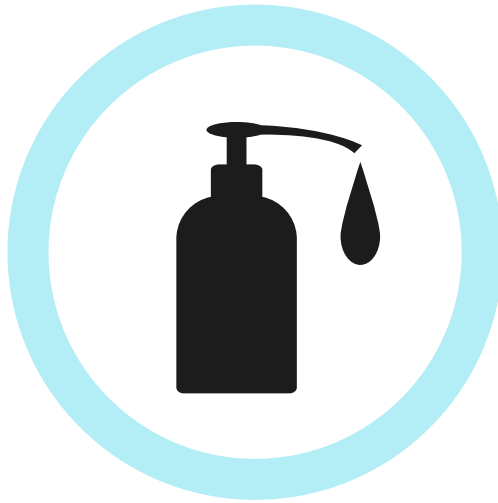
Use Soap or Hand Sanitizer